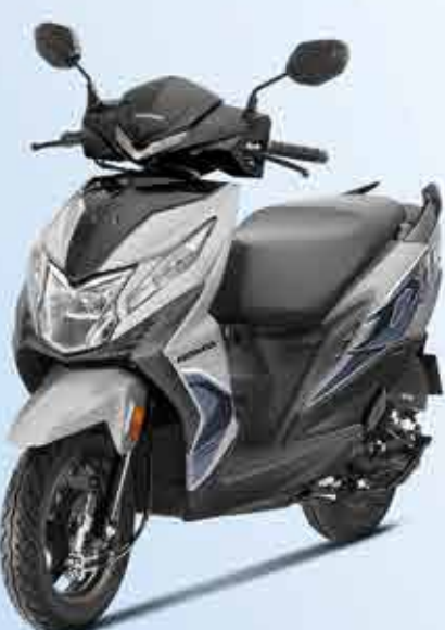
PEARL IGNEOUS BLACK + PEARL DEEP GROUND GRAY